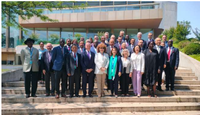
Group photograph of the Members of the International Law Commission and the ILC Secretariat.